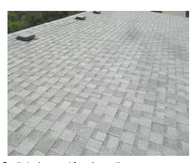
Septic tank exempt from Inspection.