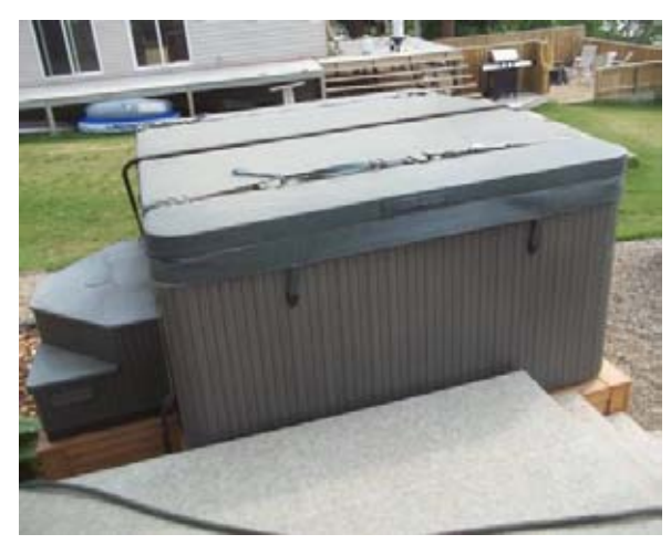
Hot tub exempt from Inspection.