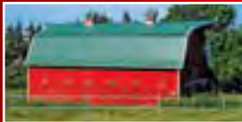
HIP ROOF BARN (7 STALLS)