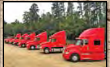
PA BOTTLERS LTD. OCTOBER 25 th - PRINCE ALBERT, SK