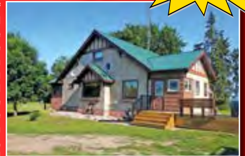
1360 SQ FT 1928 EATON HOUSE

Outstanding Ranch for Family Living – Located only 7.5 miles Southwest of Edam is beautifully laid out acreage with all the amenities a family would want. The driveway leading up to an Eaton home immediately shows the great care and attention of the property right from the manicured grass to the nicely established evergreen shelterbelt. A picturesque bright red barn with a windmill brings thoughts of simpler times along with the horses roaming through the stable area. Sheltered by the trees is a Quonset and heated shed with ample room to house the toys and a yard tractor. Just to the east of the yard-site is a 70' x 120' shed that was developed as a riding arena for the horse lovers but would also double as a large machinery shed. Right beside is an extremely well designed corral system that has been utilized for cattle, horses, and even bison. Imagine all of this on a fully cross fenced quarter section could be yours to raise your family or maybe just enjoy a quiet retirement.